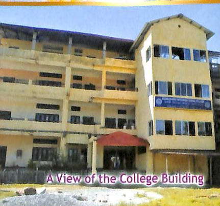
A View of the College Building