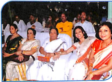
Silver Jubilee Celebration