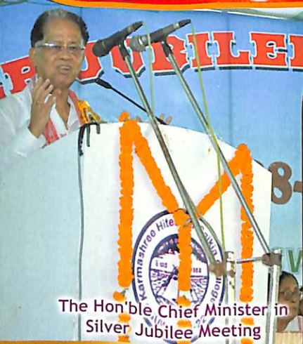
The Hon'ble Chief Minister in Silver Jubilee Meeting

An Annual publication of the College News Bulletin 3 rd Issue 2013