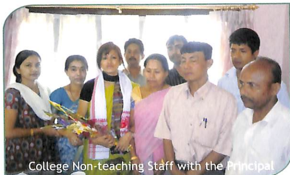
College Non-teaching Staff with the Principal