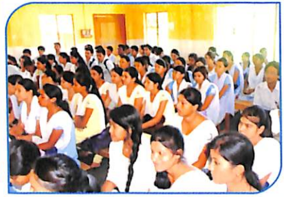
Students participating in a Lecture