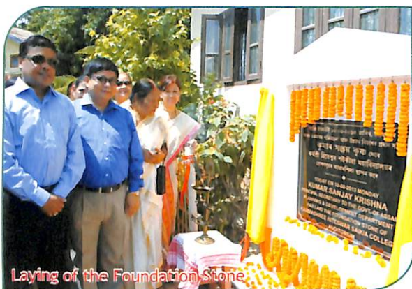
Laying of the Foundation Stone

The college received recognition under section 2(f) and 12(B) of the UGC Act. 1956 on 22nd Feb, 2013.